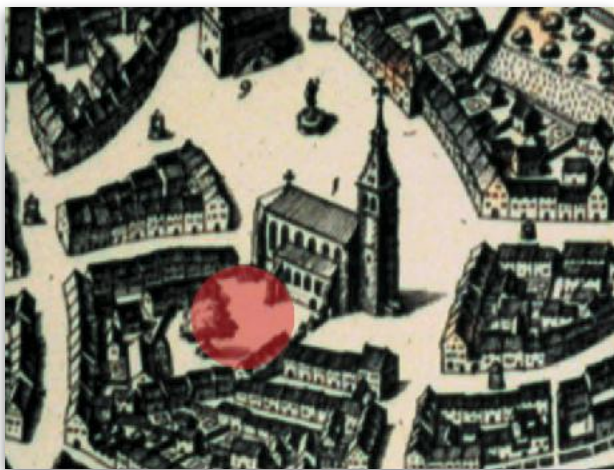
The cemetery behind the St. Stephen church

Most human communities used to foster a mythical story of its origins. Mulhouse is no exception to the rule with its legendary mill. From the 9th century onwards, human groups progressively gathered around a church and a cemetery all across Europe. In Mulhouse, a burial ground dated from that time was revealed in 1991 by archeological excavations on the current Place de la Réunion, providing evidence for a permanent human settlement. Around 940, a cemetery chapel was built inside the graveyard, sanctifying the burial ground which accommodated a mixed population of men, women and children.