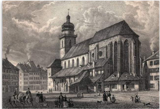
The former St. Stephen church (mid 18th century)

The parish church itself still saw burials in its side chapels until the 18th century, like those of some pastors.